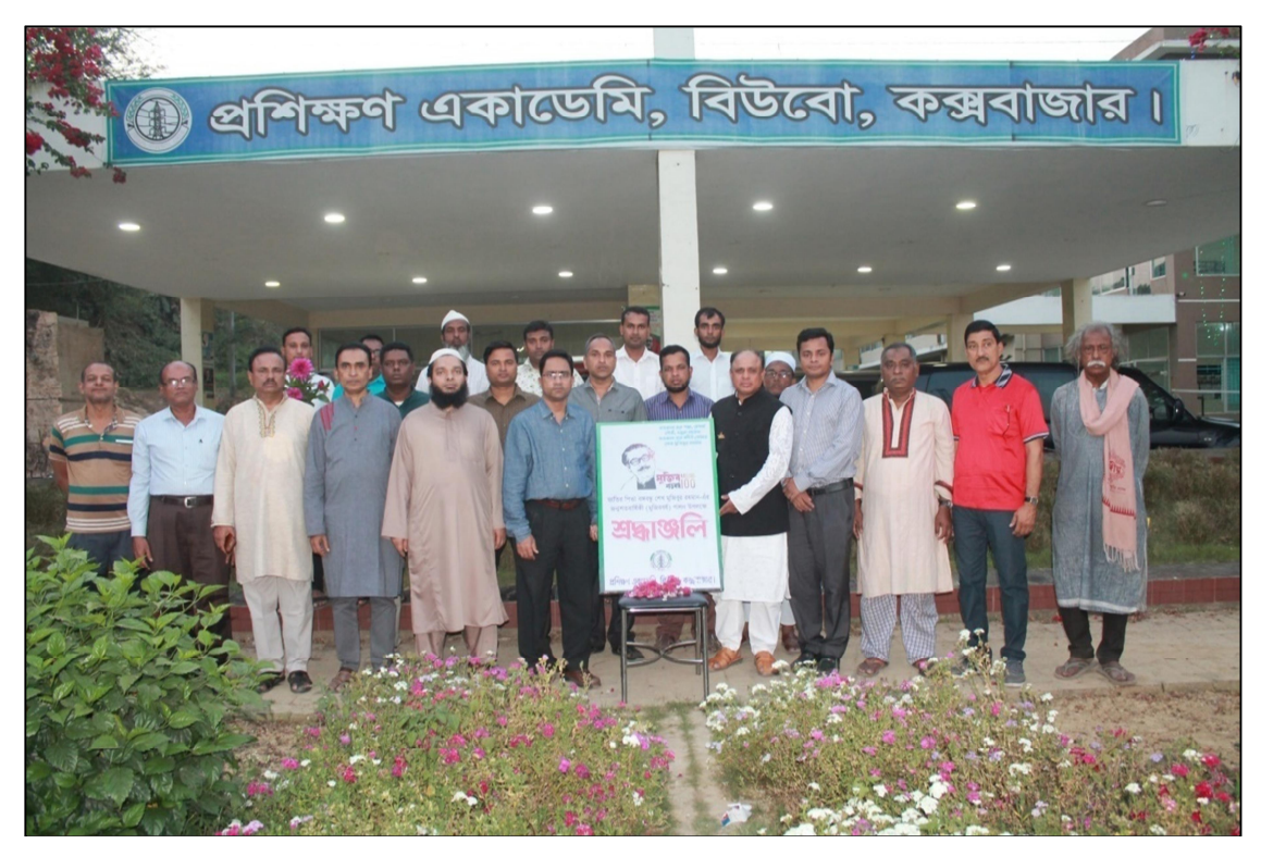
Officers and staff of Cox's Bazar Training Academy, BPDB, Cox's Bazar.

The main objective of the Training Academy is to impart training with a view to improve the professional skill of the BPDB's Personnel and to make them able to carry out their relevant functions effectively and efficiently. Training here is also enjoyable because of the location of the Academy and the vast natural beauty of the surroundings.