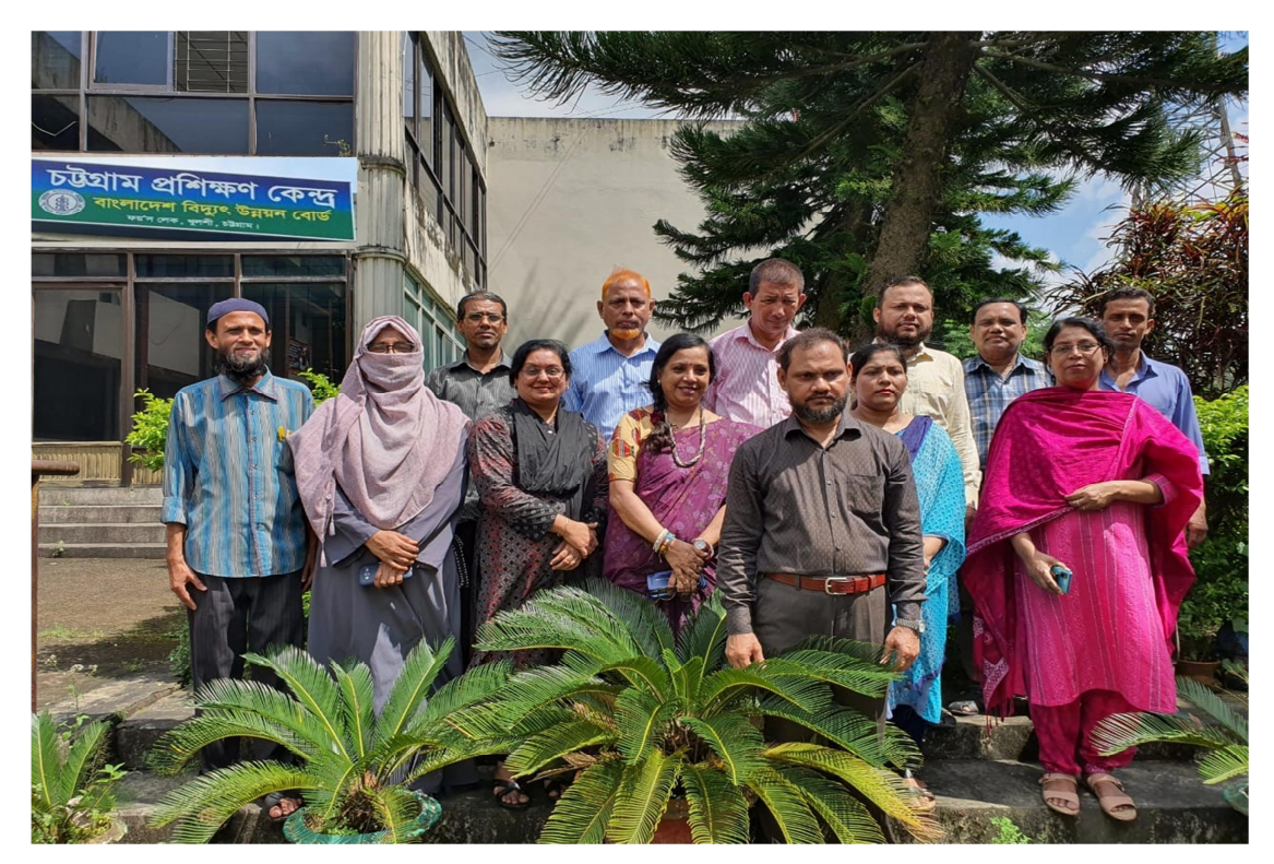
Officers and Staff of Chittagong Training Center, BPDB, Khulshi, Chattogram

Chittagong Training Center has been shifted to Khulshi at it's own premises, a healthy and pollution free enviornment in 2005 near Foy's Lake which is rich in fascinating lakes, hillocks and beautiful natural sceneries.