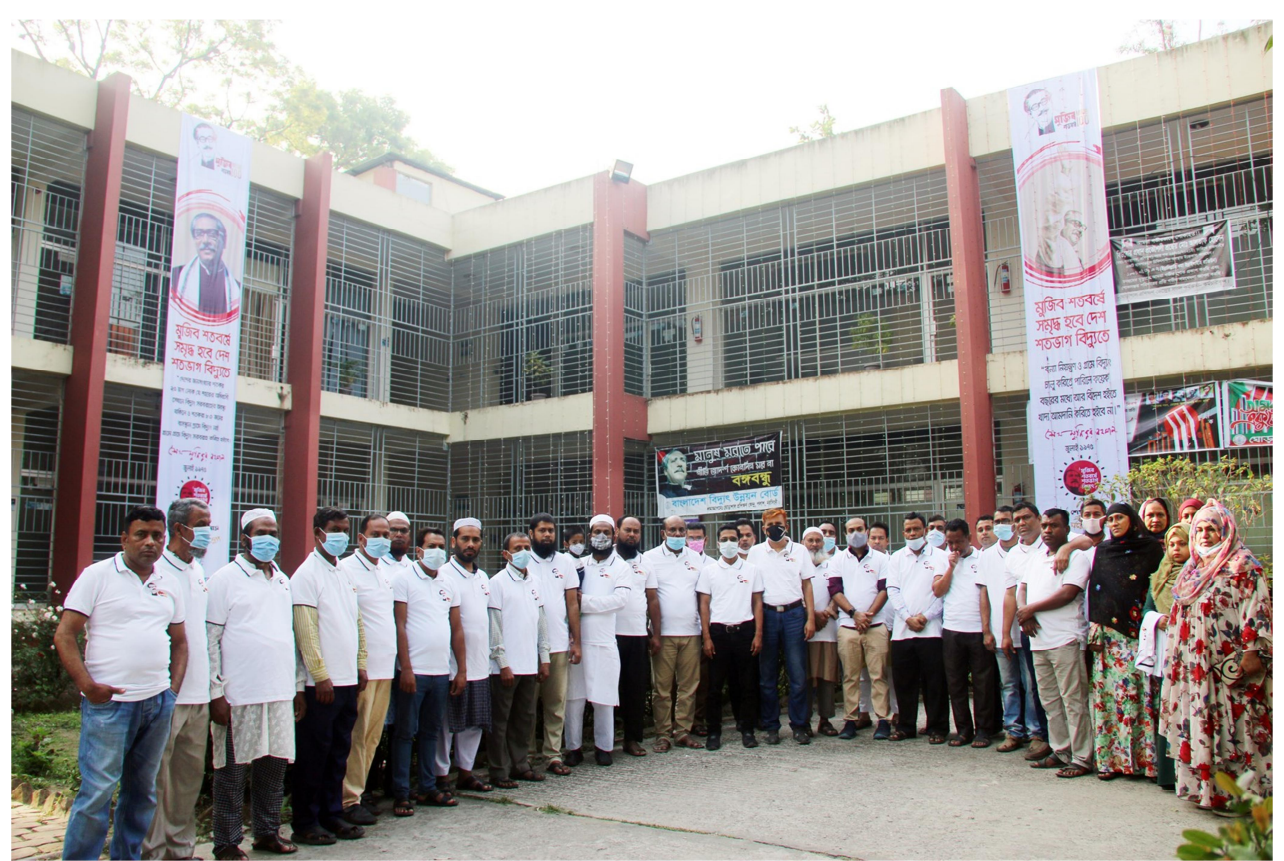
Officers and staff of Ghorashal Training Center, BPDB, Palash, Narsingdi.

GTC becomes a Center of excellence for developing patriotic, competent and professional personnel of power sector. GTC is committed to achieve the shared vision through developing competent and professional human resources by imparting quality training and development programmes. GTC demonstrate patriotism and ethics in it's activities and committed to achieving a diverse and highly professional workforce at all levels of the organization and to ensuring equity and equal opportunities for all irrespective of faith, creed, ethnicity, language, age, race, gender and physical infirmity.