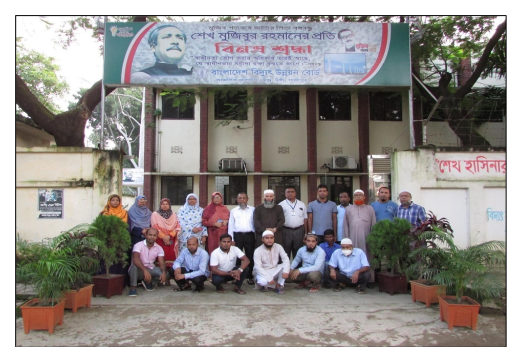
Officers and staff of Regional Training Center, BPDB, Tongi, Gazipur.

At present, this Training Center has 4 (Four) air-conditioned classrooms equipped with multimedia projectors & audio sound system. Hostel, dining & library facilities are also available here.